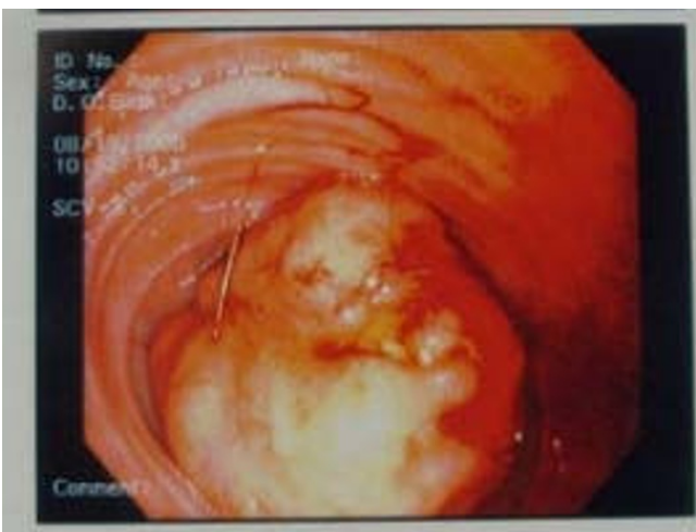
Figure 1 Endoscopic view of the carcinoid tumor.

A 44 year old male, presented to the ER with complaints of bleeding per rectum for 1 day. His complaints started with 4 episodes of watery diarrhea with dark blood. He denied any fever, abdominal pain, weight loss, and change in bowel pattern, hematemesis or jaundice. The patient had immigrated to USA 18 months prior from India where he was found to be anemic requiring two blood transfusions over the last four years. Past medical history was significant for anemia only and his home medication was an iron and folate supplement. His anemia was investigated with an esophagogastroduodenoscopy (EGD) and colonoscopy 6 months prior in India, both of which were normal. In the emergency room his vital signs revealed: temperature 98.6°F, pulse 115/min, BP 80/55 mmHg, respiratory rate 32/min and O 2 saturation 100% on room air. He was not in acute distress, abdomen was soft, non-tender, non-distended, no masses or organomegaly and normal bowel sounds. Rectal exam revealed frank blood. Significant initial lab findings