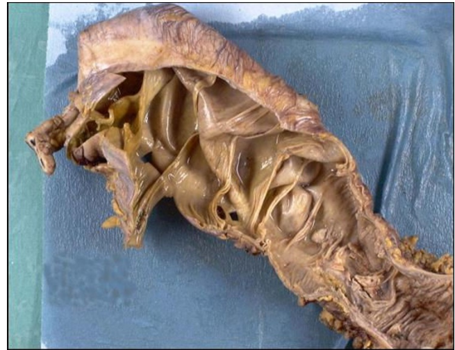
Figure 1 Macroscopic view of a resection specimen demonstrating numerous colonic diaphragms.

Microscopic examination of the specimen showed numerous elongated plicae (diaphragms) with submucosal