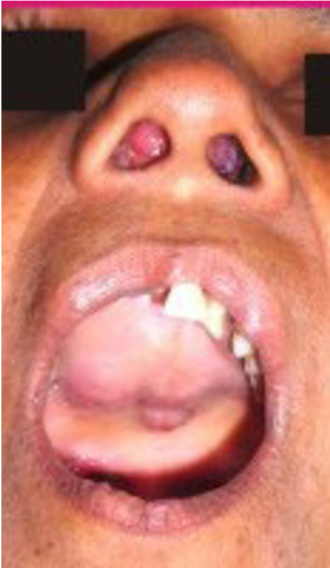
Figure 1 Pinkish polypoidal soft tissue seen in the nasal cavity with smooth bulging of the hard palate.