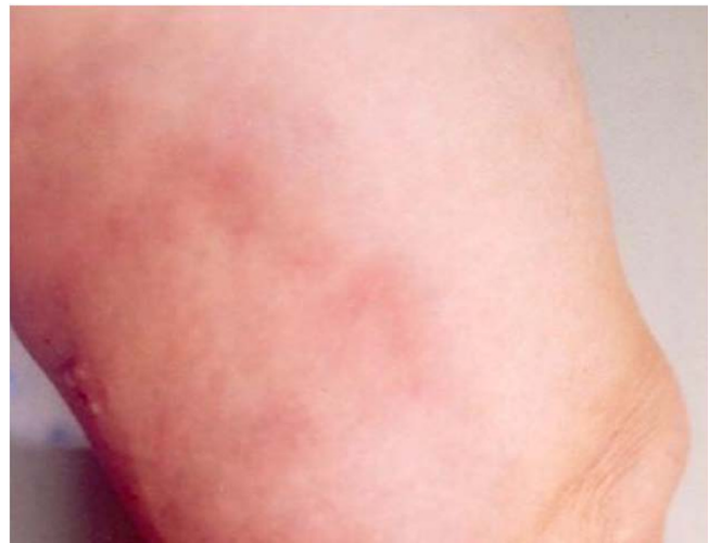
Figure 1 Clinical presentation of acute phase eosinophilic cellulitis. Inflammatory, edematous plaque at the left popliteal region.

On admission she showed a two-month-old morphea-like lesion at her right thigh and a recent inflammatory plaque at left popliteal region/left distal thigh (Figure 1). Morphea and EC were considered as differential diagnoses. Skin biopsies of both lesions revealed histologic findings characteristic of late and early phase EC correspondingly (Figure 2). Laboratory evaluation showed blood eosinophilia (44.2% of total WBC, absolute number of eosinophils 2930 cells/ \mu l) and modest anaemia (Hct 35%, Hb 11,5 g/dl). The CRP, ASOT, ESR, serum tumor markers (alphafetoprotein \alpha -FP, carcinoembryonic antigen CEA, Ca 19-9, Ca 15-3, Ca 125), routine liver and renal function tests, routine urine analysis were all within the physiological range. Increased titer of specific IgG antibodies (patient's sample to control ratio = 1.82) against Toxocara canis were determined with a commercial ELISA kit (Cypress Diagnostics, Langdorp, Belgium; test diagnostic for Toxocara infection for titer-ratio \geq 1.10). Stool microscopy was negative for parasites or parasitic eggs. Chest X ray, brain CT (to exclude subclinical CNS involvement) and duplex ultrasound of the lower extremity veins were unremarkable. Abdominal ultrasound