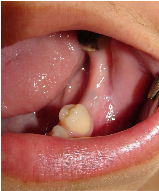
Figure 1 Intra-oral image showing blue discoloration of the alveolar mucosa (arrow) caused by soft tissue infiltration of amalgam components.

dement (Figure 3) took place and the wound was sutured with 3/0 polyglactin. The removed foreign body measured 2 mm in diameter. The patient was covered with NSAIDs and antimicrobials for 1 week. Follow-up at two weeks revealed symptoms resolution. At three months, the patient remained symptom-free.