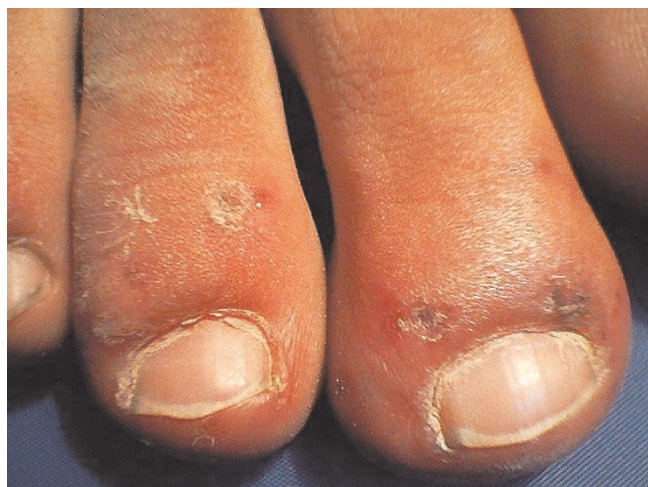
Figure 2. Perniosis of the toes, example that could be confusing.

of the lesions and the increased incidence of MRSA in the community. Trimethoprim-sulfamethoxazole double strength (160 mg/800 mg) orally every 12 hours for 10 days was prescribed. The symptoms and signs persisted and the patient arranged to see a dermatologist, who performed a biopsy of the third digit (left foot). The dermatologist declined to prescribe further treatment until the biopsy returned. The biopsy revealed a histological diagnosis of perniosis (see Figures 1,2). On further inquiry by the dermatologist, the patient stated that the evening after her pedicure she had spent several hours walking outdoors before the aforementioned university event. She