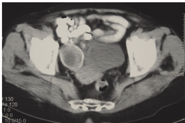
Figure 2. CT section at the level of the pelvis. A second cystic mass completely calcified is present at the right ovary.

Written informed consent was obtained from the patient for publication of this case report and accompanying