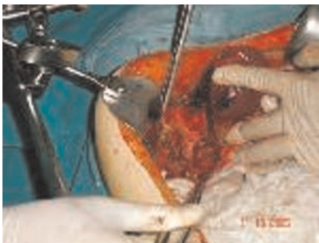
Figure 5. Intraoperative picture of the hydatid cyst that has already been drained and partially resected.

images. A copy of the written consent is available for review by the Editor-in-Chief of this journal.