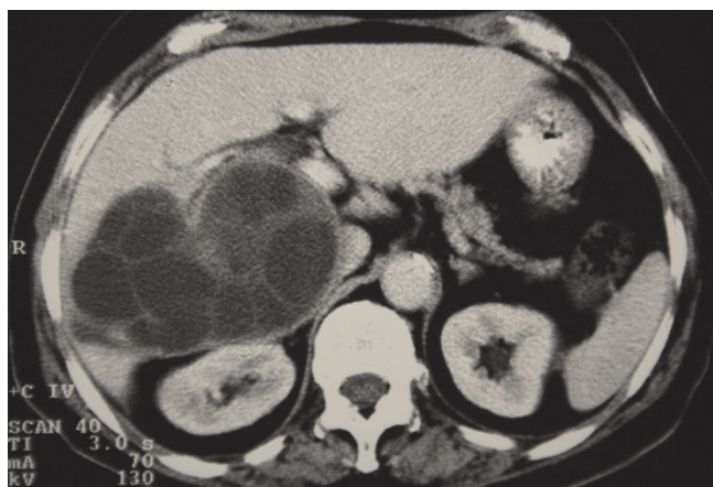
Figure 1. Contrast enhanced CT section at the level of the right subhepatic space. A large multilobular cystic mass of the right liver lobe is present extending to the subhepatic space.