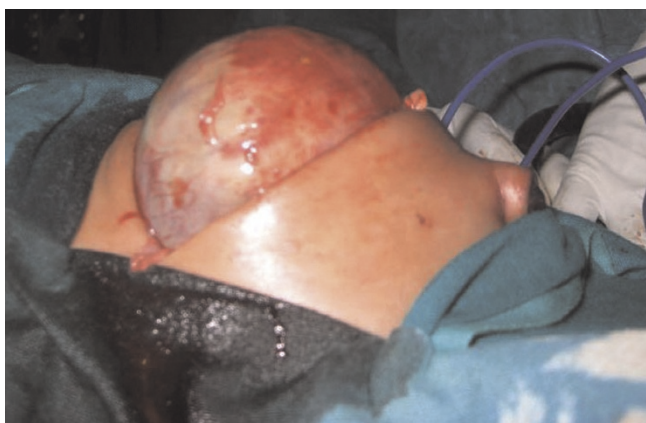
Figure 3. Intraoperative photograph of the baby showing the giant meconium cyst.

intraoperative finding of a giant cyst containing meconium surrounding the terminal ileum, the site of perforation in our case. This phenomenon is rare in multiple pregnancies. Whether this is a true rarity or under reporting is unknown. Again, the sex incidence of meconium peritonitis is uncertain. In contrast to Tseng et al [5] series involving 19 cases of meconium peritonitis having 6 boys and 13 girls, Ali and ul-Hassan [11] series of 20 meconium peritonitis have 14 boys and 6 girls while Hsu et al [12] series, also involving 20 meconium peritonitis have male female ratio of 1.5:1.