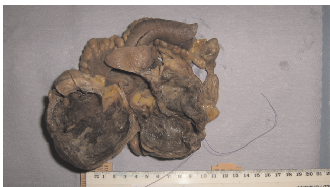
Figure 1. Resected specimen showing Giant Meckel's diverticulum.