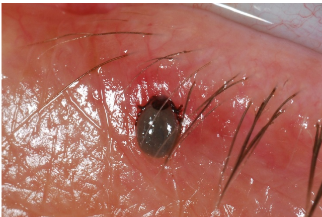
Figure 2 lower lid tick infestation picture.

Written informed consent was obtained from the patient for publication of this case report and accompanying images. A copy of the written consent is available for review by the Editor-in-Chief of this journal.