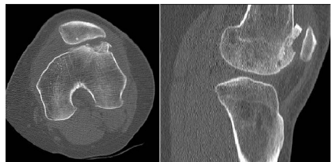
Figure 3 Axial and lateral CT of left knee one year after trochleaplasty demonstrating irregular lateral condyle due to nonunion and collapse of subchondral bone.

Patellofemoral instability may result from anatomical deficiencies in one of three anatomical structures that stabilise the patellofemoral joint: the trochlear groove geom-