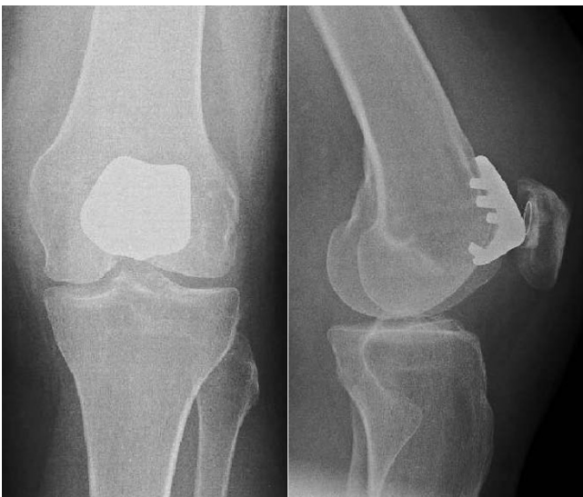
Figure 5 Postoperative radiographs of the left knee with patellofemoral prosthesis in situ.

etry, the medial and lateral retinacula including the medial patellofemoral ligament (MPFL), and the alignment of the extensor apparatus including the quadriceps muscles, patellar tendon and tibial tuberosity. If nonoperative treatment fails, surgical treatment should aim to correct the identified anatomical deficiencies [1].