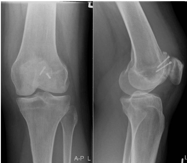
Figure 2 Radiograph of the left knee 5 months after trochleaplasty.

Five months later she still had persistent pain on the anterior aspect of the left knee without a history of trauma or patellar dislocation since the procedure. Radiographic examination demonstrated nonunion of the trochlear osteotomy with dislocation of subchondral bone resulting in an irregular patellofemoral joint (Figure 2). Arthroscopy was performed with removal of the screws.