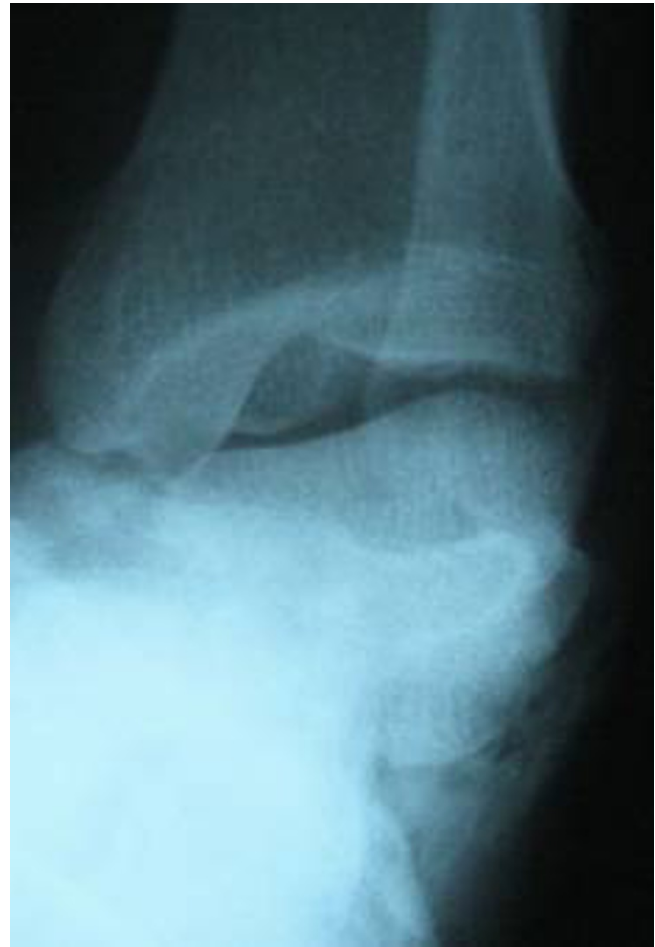
Figure 2 Antero-posterior radiograph of the ankle showed total lateral talus dislocation.

Irreducible subtalar joint was responsible for unsuccessful closed reduction. The head of talus was trapped between flexor hallucis longus and flexor digitorum longus tendons. All ruptured elements was repaired. We checked the neurovascular status of the foot which was normal and then we applied a short leg cast (Fig 4).