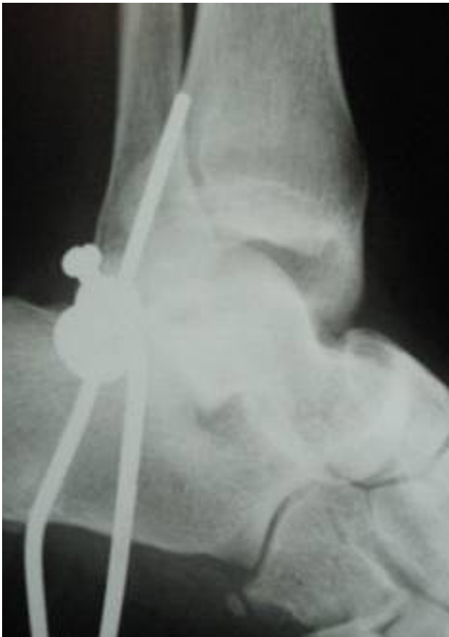
Figure 1 lateral radiograph of the ankle showed total lateral talus dislocation.

Closed manipulation of talus dislocation was tried with the aid of a calcaneal pin but C-arm proved the reduction to be unsuccessful. We attempted open reduction via an anteromedial approach.