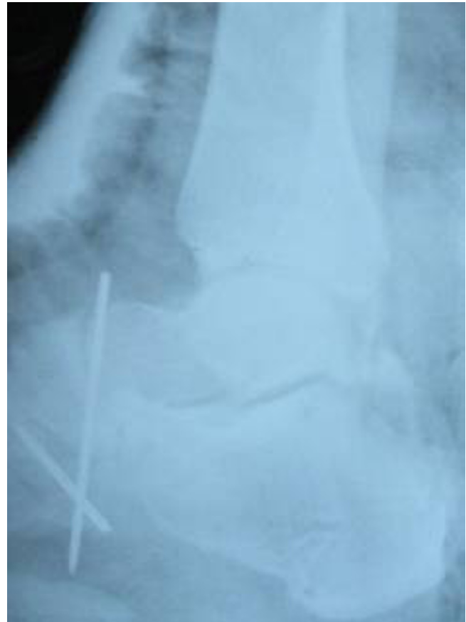
Figure 4 Post closed reduction X-ray.

In the present case the mechanism of injury is axial loading because of falling with or without supination or pronation injury. Because of high energy nature of trauma, combination of mechanisms are responsible and an exact