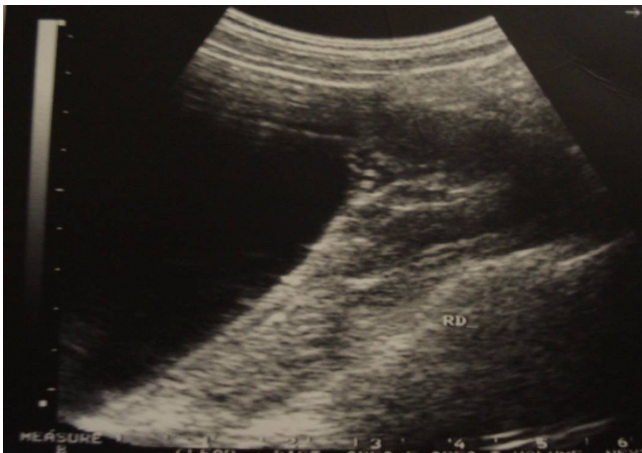
Figure 1 Ultrasonography showing a giant right renal cyst.

50% of the adult population. The large use of ultrasonography and CT produced an increase in the detection of renal cysts [4]. Simple renal cysts occur with an incidence of at least 20% by 40 years of age and 33% by 60 years. However, giant renal cysts measuring more than 15 cm rarely occur and association with secondary hypertension is uncommon [5].