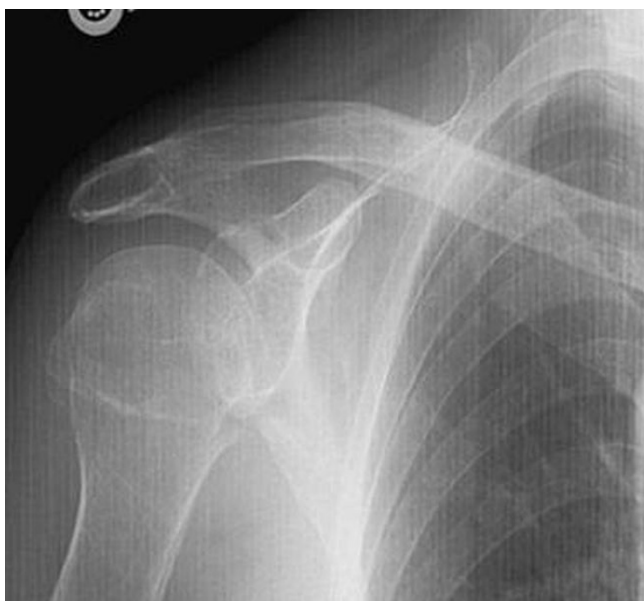
Figure 1 AP view showing minimally displaced fracture of proximal humerus.