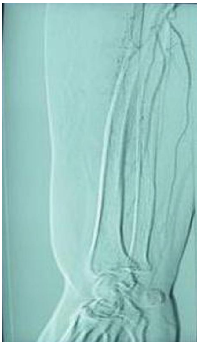
Figure 4 Diminished flow in radial and ulnar arteries.

There are several mechanisms by which the axillary artery can be injured in proximal humeral fractures. A direct injury to the artery by a sharp bony fragment can cause laceration and rupture [1], violent overstretching can result in rupture especially in an atheromatous artery [6] and another important mechanism of injury is intimal tear and thrombosis. The artery stretches across the bony fragment, the adventitia remains intact and the fragile intima tears, leading to thrombosis. In our case, the angiography showed kinking and compression of the axillary artery at the fracture site which probably resolved spontaneously prior to intimal injury and thrombus formation. Axillary artery injury has also been described in a case of blunt injury to the shoulder without any fractures. Angiography in that case showed leaking of contrast material