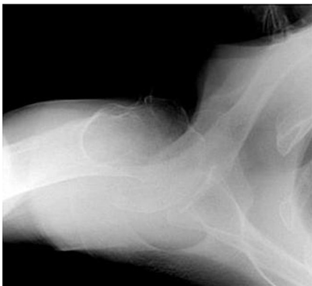
Figure 2 Axial view.

The patient was admitted for monitoring of the distal pulses, but no further loss of pulsations was documented. At 12 months of follow-up, she had good functional outcome with a normally perfused limb.