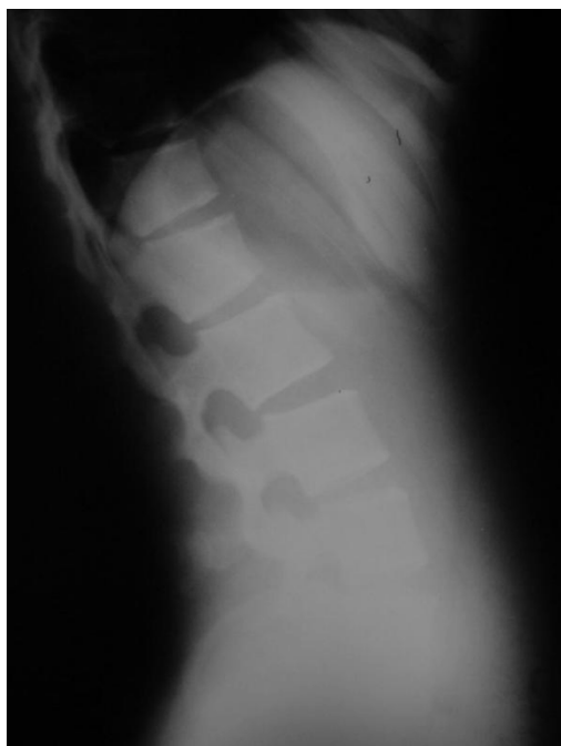
Figure 2 Lateral plain radiography of lumbar with L3 osteochondroma.

The tumor was excised en bloc through a posterior approach (Figure 5). Histopathological examination verified the diagnosis of osteochondroma. During 19 months follow-up, no recurrence was detected.