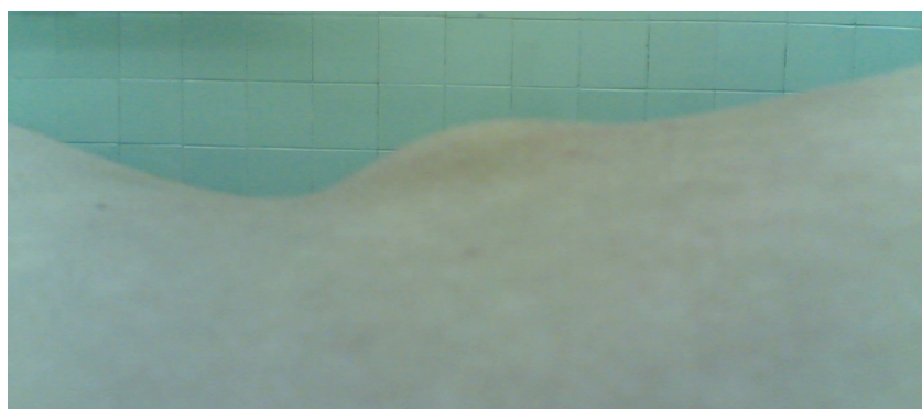
Figure 1 A 16 years old female with lower lumbar osteochondroma.

from the posterior elements of the L3 and rolled out any Congenital anomalies (Figure 2).