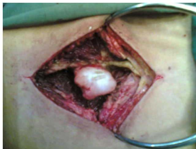
Figure 5 Intraoperative view of osteochondroma of L3 spinous process.