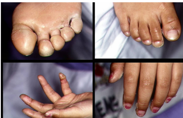
Figure 2 Desquamation of the feet (2A, 2B) and hands (2C, 2D).

The patient's condition gradually improved and she was discharged home after 3 weeks, and received another 3