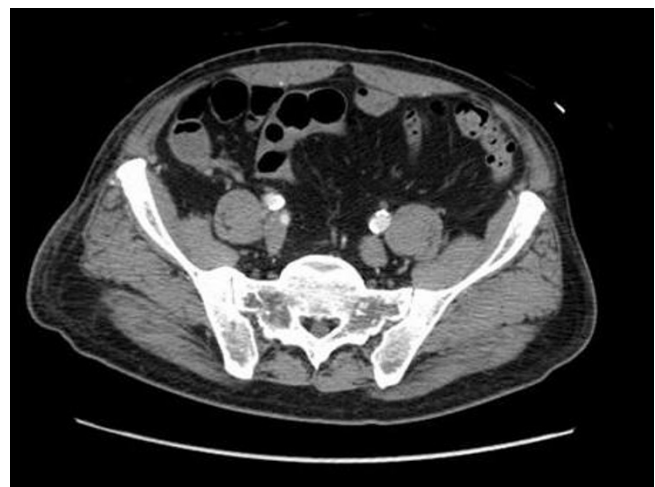
Figure 4 Abdominal CT scan. An angio CT scan showed calcific atheromatous plaques in the abdominal aorta and iliac arteries.

In the twenty seventh day of admission, eighth day of imipenem and sixth day of linezolid, the fever completely subsided and the patient showed favorable progress. The only complication was a normocytic anemia in day 18 of admission (Hemoglobin - 7.4 g/dl, with MCV of 86.6 fL), with the need for packed red cells transfusion. Imipenem was stopped after nine days and linezolid after 28 days. He was discharged after 49 days to our outpatient clinic for follow up; 9 days after being discharged he underwent another transfusion for normocytic anemia (hemoglobin of 7.6 g/dl, with MCV of 84.8 fL). The white blood cell and the platelet counts remained unchanged; only red blood cell count was affected. He maintained smoking habits