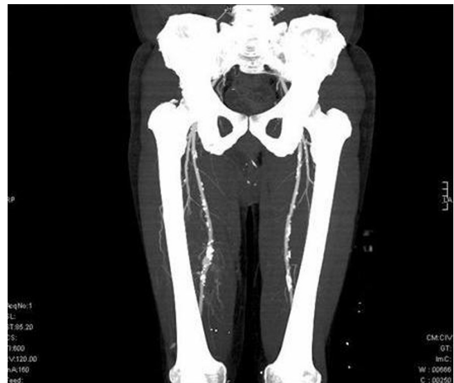
Figure 1 CT scan. Atheroma plaques in all arterial vascular beds focused (inferior limbs).