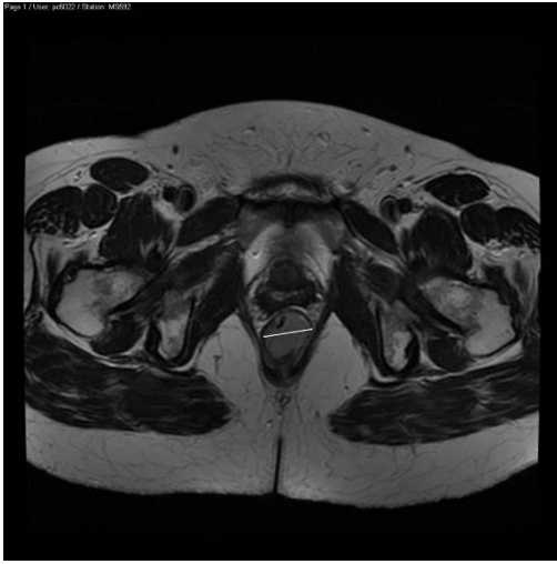
Figure 1 MRI of the anal canal showing the tumour.

ual tumour. Twelve months after completion of treatment the patient relapsed with liver and lung metastasis although the primary site remained clear. No response was seen to palliative chemotherapy and the patient succumbed to metastatic disease 18 months following the initial diagnosis.