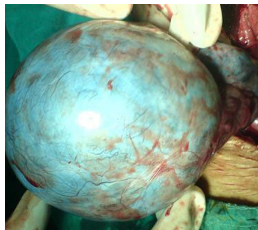
Figure 3 Ovarian cyst showing torsion around its pedicle.

Complications of the cysts associated with pregnancy are torsion of the cyst, rupture, infection, malignancy, impac-