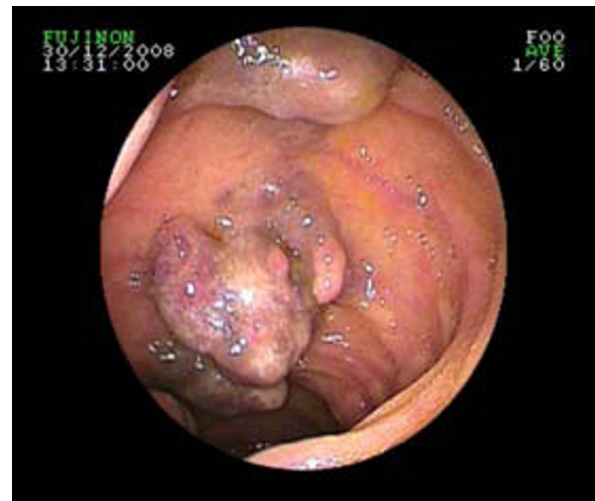
Figure 3 DBE demonstrating presence of multiple areas of vascular abnormalities within the small bowel lumen.