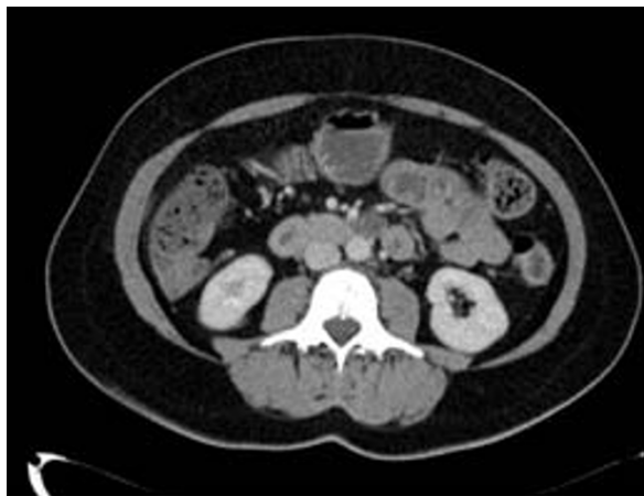
Figure 1 CT enteroclysis demonstrating nodular thickening of the jejunum.