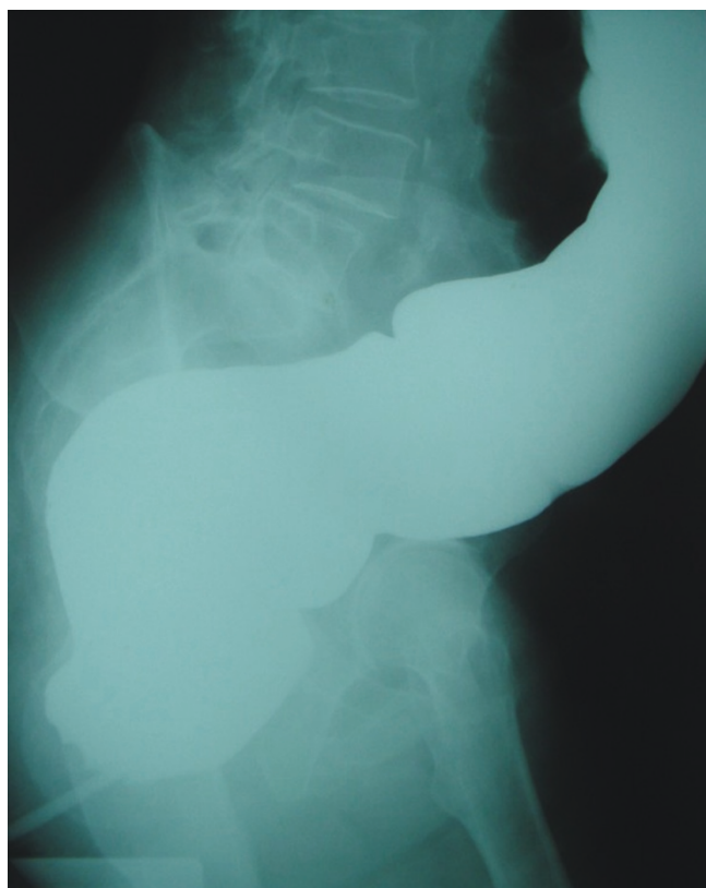
Figure 3. Lateral X-ray of the abdomen revealing barium in the distended colon.

barium which dilated the rectum, sigmoid and descending colon accompanied by extravasation. The probable cause of the excessive amount of the intraluminal barium and colonic perforation was the generation of excessive pressure during the procedure. Besides the potential risk factors, such as injury to the rectal mucosa or anal canal due to the enema tip or retention balloon, excessive transmural pressure may be the only reason of the perforation during barium enema as in our case. Fry et al and Williams and Harned suggest that the incidence of colorectal perforation during barium-enema radiography can be reduced by 1) performing proctoscopy prior to barium enema, 2) avoiding the use of the rectal balloon in patients with known rectal lesions, using a safe tip-balloon design and inserting it after a careful digital rectal examination 3) avoiding barium studies in patients with active colitis, 4) delaying the examination by at least six days in cases of deep biopsy or polypectomy, 5) avoiding generation of pressure greater than that created by a column of barium suspension of one meter, and 6) using a lower concentration of barium when possible [1,3].