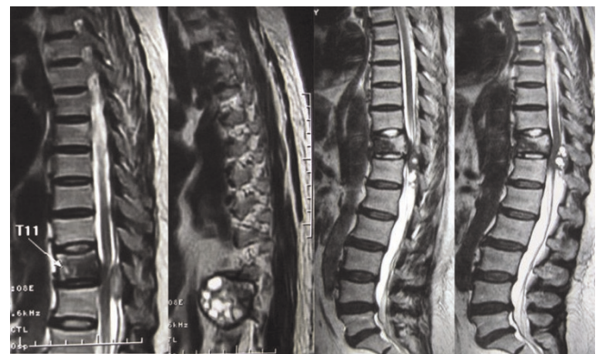
Figure 2. Sagittal T2-weighted MR images showed paraspinal cystic lesion was involved in T11 vertebrae and disc space. Multiple small daughter cysts formed a grape bunch-like image. The thoracic dural sac was narrowed due to the compression of multiple small hydatid cysts like CSF signal intensity.

cavity was irrigated with hypertonic saline. Anterolateral vertebrectomy, fusion and fixation were performed between T10–T12 with an iliac autograft (Figure 4a–b). Histopathological examination revealed a hydatid cyst.