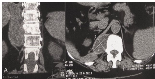
Figure 1. (A) Coronal CT scans showed that right lateral of paraspinal cystic lesions were involved in partial vertebra at the level of T9–T12. The prominent destruction of T11 vertebra was visible. (B) Axial CT scans at the level of T11 showed a mass of 5 × 2.9 cm diameter was localized in the posterior mediastinum. The cyst has water density and at the posterior wall there are some foci of calcification.

Since the presence of a neurological deficit was clear, the patient was operated on anterior circumferential decompression. All the cysts were removed and then the