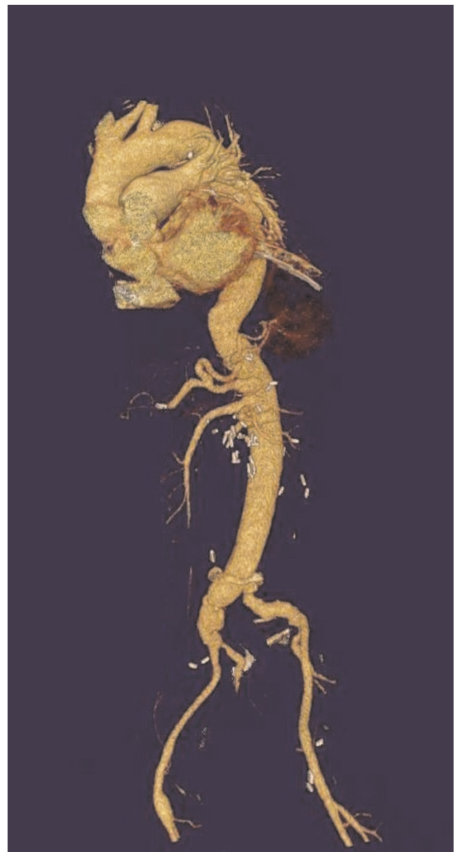
Figure 2. Postoperative Computed Tomographic Angiogram following Crawford Type IV Thoracoabdominal aneurysm repair using the Coselli graft.

The disadvantages identified, firstly include the extra time required to complete the four individual anastomoses compared to a single patch anastomosis. Secondly, the