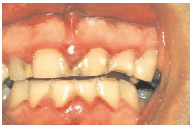
Figure 1. Clinical photograph of the anterior gingiva of a 27-year-old male showing necrotizing ulcerative gingivitis (NUG).

to NUG [1]. Metronidazole 200mg tablets three times a day were prescribed at the first visit and combined with palliative treatment, consisting of scaling, home care instruction and a mouthwash.