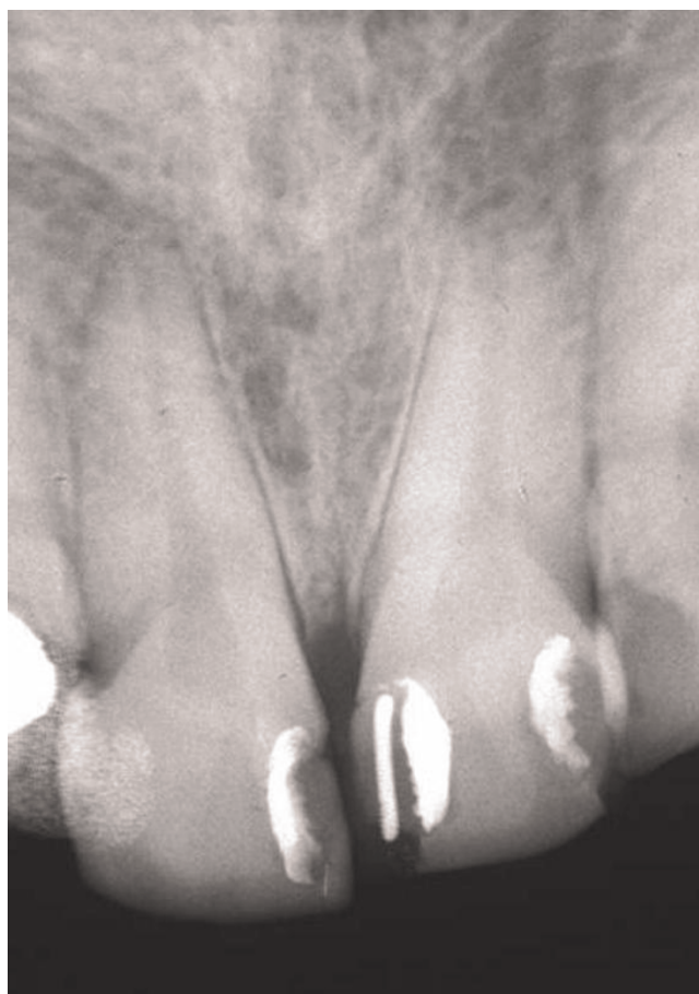
Figure 2. Intra-oral radiograph of the maxillary incisors at time of NUG diagnosis. The angle of the x-ray has shortened the roots.

The synthetic crown margins were just apical to the gingival margin, a long way from the CEJ, on the convex facial surface of the clinical crowns, in a position conducive to trauma from "food impaction" and the accumulation of plaque, contributing to chronic inflammation [3].