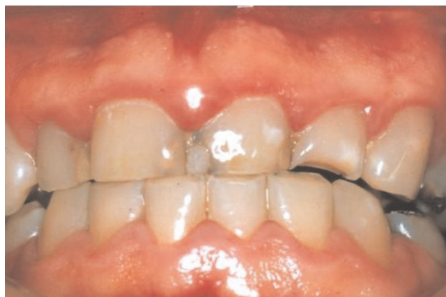
Figure 3. Clinical photograph of the anterior gingiva after palliative periodontal treatment.