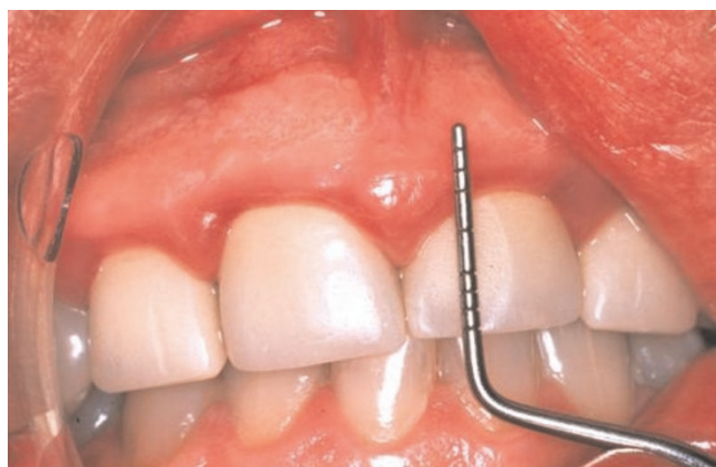
Figure 4. Clinical photograph showing synthetic crowns and a periodontal probe indicating clinical crown length.