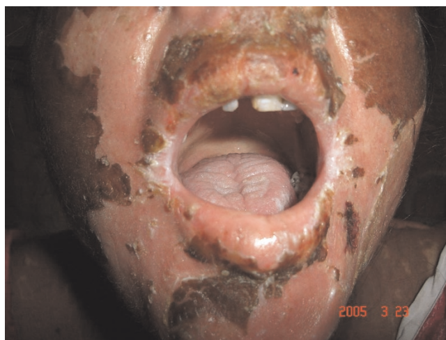
Figure 5. Involvement of the oral mucosa (Case no. 2).

even for closely chemically related products. Multiple precipitating causes may co-exist [3]. The earlier a causative agent is withdrawn the better is the prognosis. Patients on drugs with longer half-lives have an increased chance of dying [4]. An increased incidence of toxic epidermal necrolysis has been observed in patients with brain tumors, systemic lupus erythematosus, acquired immune deficiency syndrome and high dose steroid therapy [5]. Other precipitating causes include viruses, bacteria, fungi, immunization, neoplasms, graft versus host disease, radiotherapy, beverages fumigants and idiopathic.