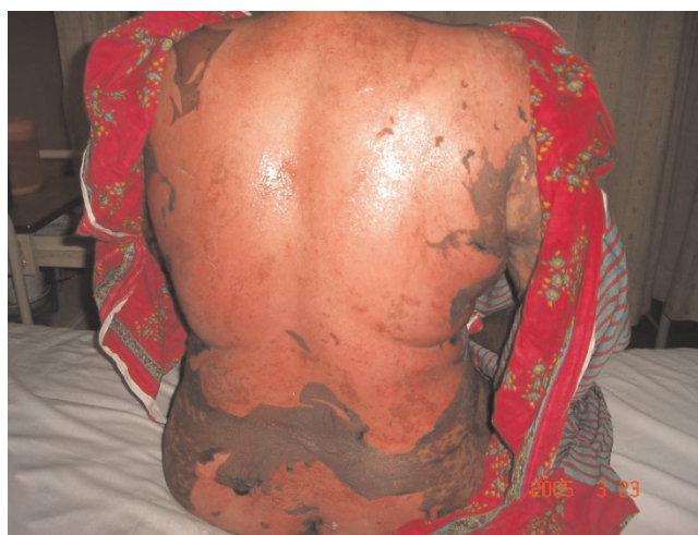
Figure 2. Peeled skin over the back and buttocks (Case no 2).