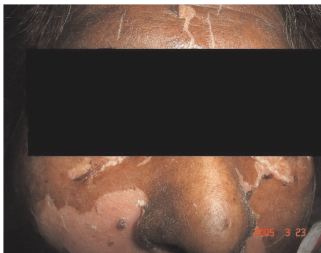
Figure 3. Involvement of the face (Case no. 2).

recovery over the next 2 weeks; all the skin lesions healed without scarring and there were no sequelae except for a corneal opacity in the right eye.