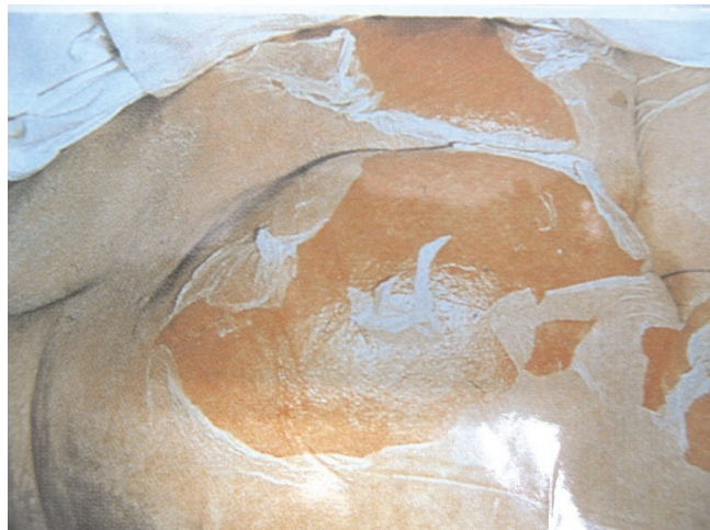
Figure 1. Peeling of sheets of skin and erosions over the buttocks (Case no. 1).

A 45-year-old Pakistani female of Caucasoid origin was admitted to the dermatology ward with extensive peeling of skin over the back and buttocks. She had taken a quinolone (moxifloxacin) for fever 05 days ago which was followed by a morbilliform eruption and widespread peeling of skin. She was a known diabetic for the past 10 years on insulin injections. On examination she was conscious but distressed, dehydrated and febrile with a temperature of 101 degree Fahrenheit, B.P. 130/90, pulse 98/min. She had skin peeling involving about 60% of the body surface area including the back, buttocks, face, neck and limbs (Figures 2-4). Oral and conjunctival mucosae were severely involved (Figures 5 and 6) and Nickolsky's sign and skin tenderness were positive. Biochemical profile revealed raised serum urea 10.7 mmol/lit, creatinine 75 umol/lit, sodium 137 mmol/lit, potassium 3.8 mmol/lit, her ALT was also raised 87 IU but serum bilirubin and alkaline phosphatase were within normal limits. The blood counts, urinalysis, X-rays chest and electrocardiogram revealed no abnormality. Skin biopsy showed sub-epidermal clefting with a mixed infiltrate of polymorphs. The patient was treated with intravenous dexamethasone 3 mg 8 hourly and intravenous ceftriaxone 1 gm twice daily, intravenous insulin on a sliding scale along with topical antiseptic dressings and fluid and electrolyte replacement therapy. The steroids were gradually tapered off and the patient exhibited an uneventful