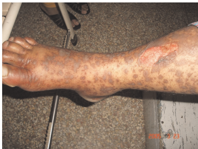
Figure 4. Rash and erosion over the lower limb (Case no. 2).

Drugs are the most common cause accounting for about 65%-80% of the cases. The most common offending agents are sulfonamides, NSAIDs, butazones and hydrantoin [2]. The risks related to different drugs are different