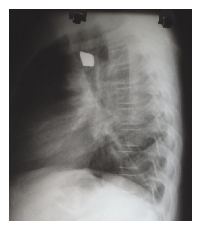
Figure 2. Lateral chest X-ray showing radio-opaque foreign body.

ill-equipped. Our patient suffered the brunt of the aforementioned with referrals between three major hospitals before receiving appropriate treatment.