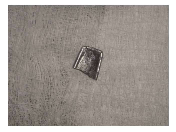
Figure 3. The extracted metallic foreign body.

Quick diagnosis and treatment of endobronchial foreign bodies is of utmost importance to avoid life threatening