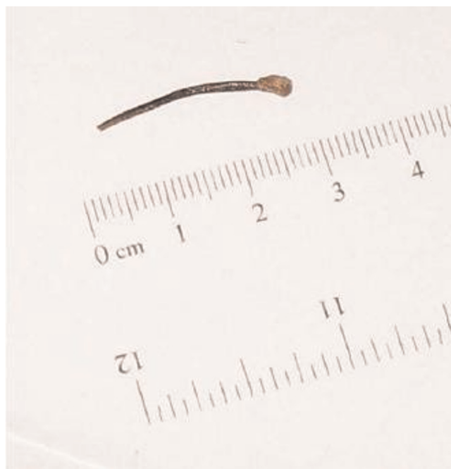
Figure 3. The foreign body removed from the abscess cavity at the time of surgery.

enabling them to arrest in the caecum and gravitate towards its dependent position [4,7]. A variety of foreign bodies have been found in the appendix ranging from sewing needles, retained shot pellets, tongue studs,