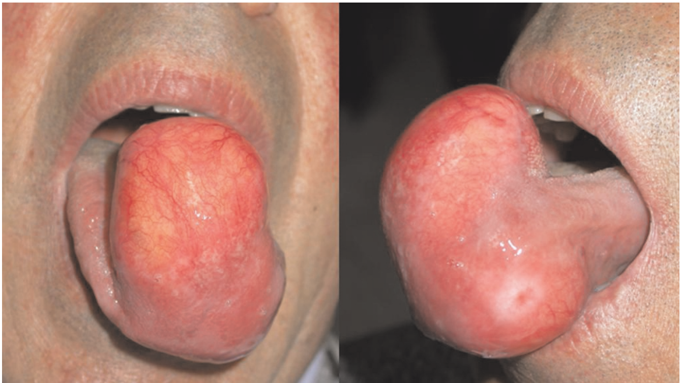
Figure 1. Clinical examination showing a giant, yellowish, submucosal mass involving tongue.

a high density, consistent with lipomatous tissue. The diagnosis of lipoma was proposed, accordingly. A transoral V-shaped surgical excision was performed under loco-regional anesthesia. Sutures were removed on the 10 th postoperative day. The specimens were fixed in 10% buffered formalin, and embedded in paraffin for routine histological examination.