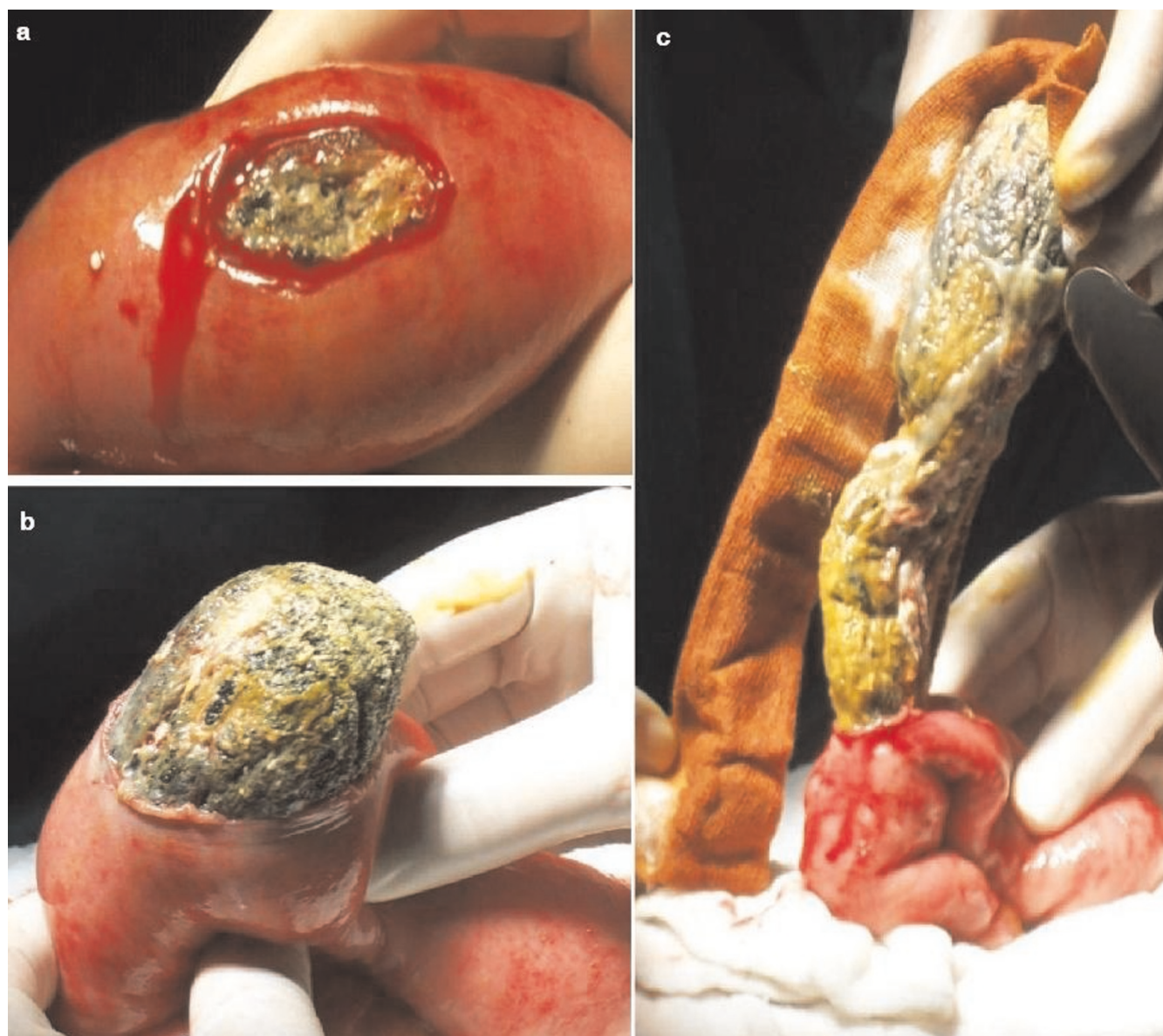
Figure 3a, b and c. The compress was removed at enterotomy.