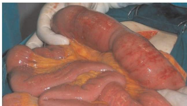
Figure 2. A mass obstructing the lumen of the ileum was observed during laparotomy.

and C-reactive protein at 45 mg/l. The blood cell count revealed leukocytosis at 17,500/ \mu l, with a hemoglobin level of 12.9 g/dl, and a platelet count of 327,000/ \mu l. Other serum parameters were within normal limits. The physical examination revealed muscular guarding and rebound tenderness in the periumbilical region. An upright plain abdominal film revealed small bowel obstruction with marked small bowel air-fluid levels. No pathological findings were observed via ultrasound because of distension. The patient underwent an emergency laparotomy with a midline incision. At laparotomy, a mass was observed obstructing the intestine completely 150 cm distal to the ligament of Treitz (Figure 2). A 15 × 20 cm surgical compress was removed at enterotomy