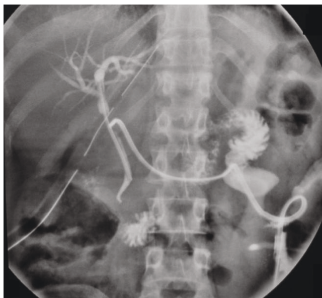
Figure 2. T-Tube cholangiogram done on post operative day 14 shows normal biliary tract with patent bilio-enteric pathway. Cholecystectomy was done about 5 years ago.

A biloma is a well-demarcated, encapsulated or not, bile collection outside the biliary tree secondary to iatrogenic, traumatic or spontaneous injury of the biliary tree. Gould