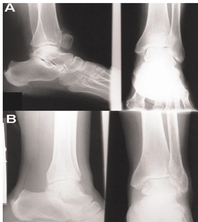
Figure 1. (A) Anteroposterior and lateral X-rays of left leg. (B) Anteroposterior and lateral X-rays of right leg.

A 61-year-old woman, White Caucasian from Iranian origin, was referred to our outpatient rehabilitation clinic with pain in the left foot. Her main complaint was pain in the anterior side of left ankle joint mainly in heavy physical activity and in going upstairs. There was no history of trauma and her medical history revealed no abnormality. On examination, there was a stiff and immobile mass with 2-2.5 cm diameter located just anterior to the ankle joint. Patient stated that he have been had this protuberance since childhood. There was no swelling or tenderness. She described pain in dorsiflexion of the ankle joint. Plain radiographies showed the presence of a large accessory bone without osseous pathology (Figure 1A). X-ray evaluation of right foot and ankle were normal (Figure 1B). Computed tomography scans of the left ankle was not demonstrated any fracture or osseous pathology (Figure 2). All of evidences including