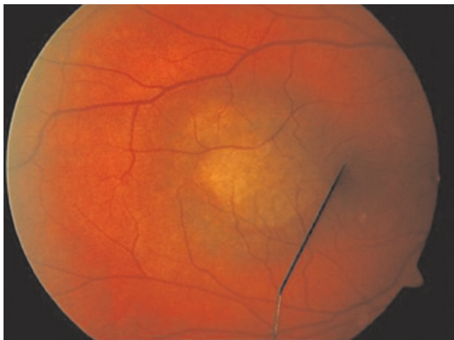
Figure 1. Color fundus photograph of the right eye of the patient.

Clinically on fundus evaluation CCH is typically a solitary dome shaped mass with an orange-red appearance. There can be a grayish appearance due to the fibrous metaplasia of the overlying retinal pigment epithelium [1]. The diagnosis is based upon a strong index of suspicion and presence of findings on A and B scan ultrasonography, which typically show a solid mass with medium to high reflectivity and acoustic solidity. Fibrous and osseous