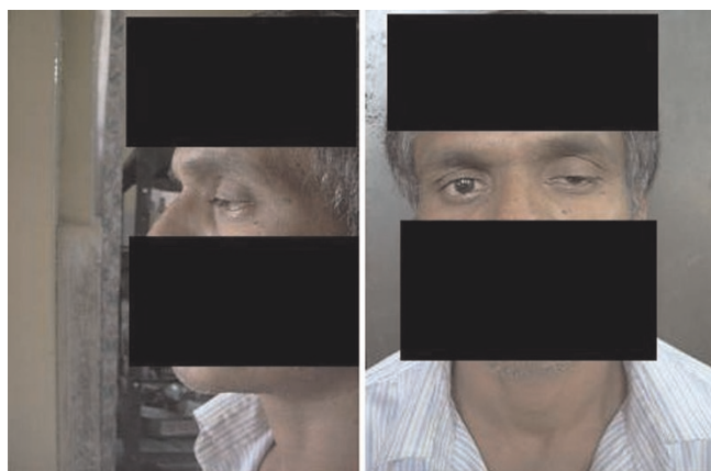
Figure 1. Showing ptosis in left eye in both the views left lateral and front view.

was present (Figure 1), with rest of the movements normal in both eye. There was no proptosis on presentation. Bilateral pupils were normal in size reacting to light. Fundus examination was normal. No other cranial nerves were involved. No neurodeficit was present.